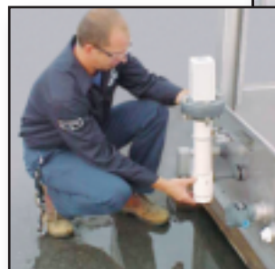
Electrical Water Level Controls