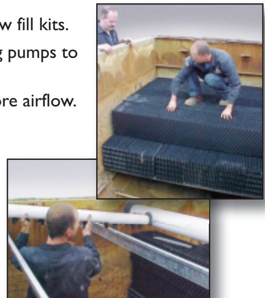
Water Distribution Systems and Counterflow Fill

Mr. GoodTower® Service Centers will evaluate existing equipment layouts and recommend replacement units.