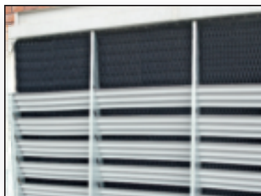
Mr. GoodTower® High Efficiency Fill