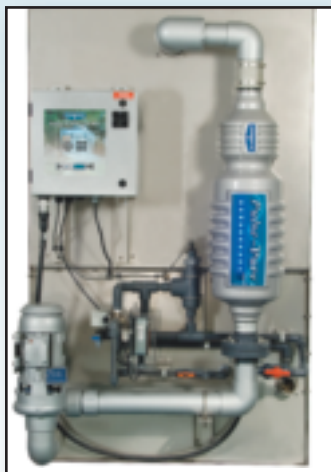
Pulse~Pure Non-Chemical Water Treatment System