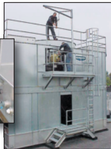
Custom Platforms and Ladders

Mr. GoodTower® Service Centers stock parts for emergency repairs!