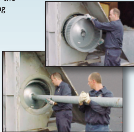
Fans and Shaft Kits