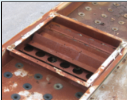
Corroded Hot Water Basin