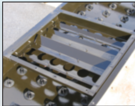
Hot Water Basin Coated with EvapLiner