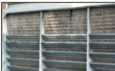
Old, Inefficient, Damaged Fill