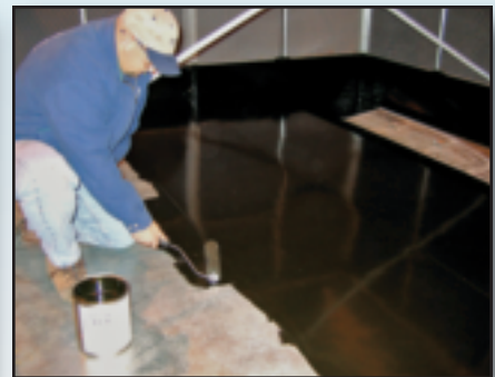
Quick Curing Time